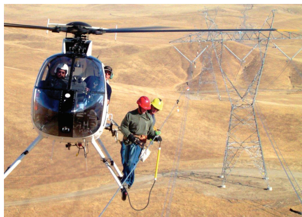
Installation by helicopter on existing power lines